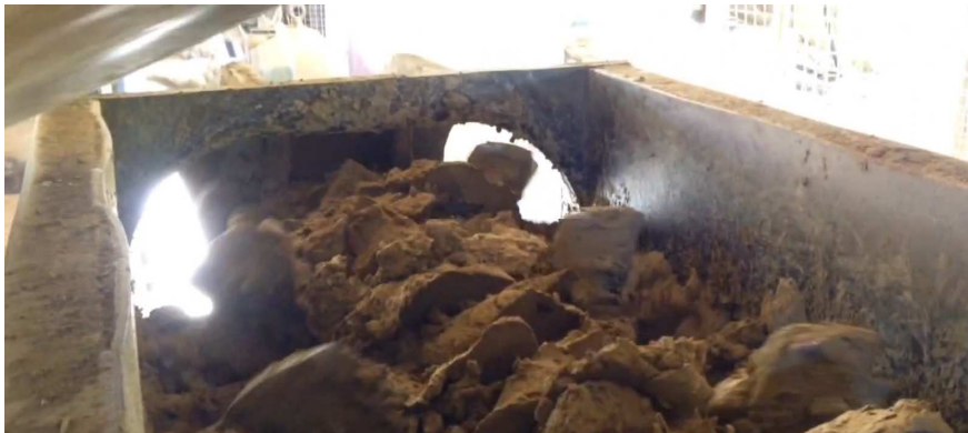
1 Shredder Pavan 600x300