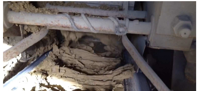
1 Mixer Pèlerin (model: 2R75 S/N: 11454)